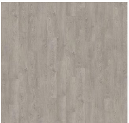
Parquet Grey Ashwood