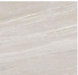
Faience Museum Mainstone Cloud Mat