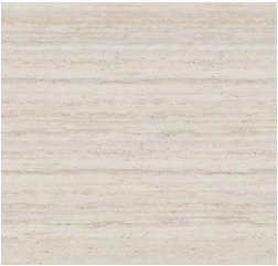
Travertino Pearl Porcelain