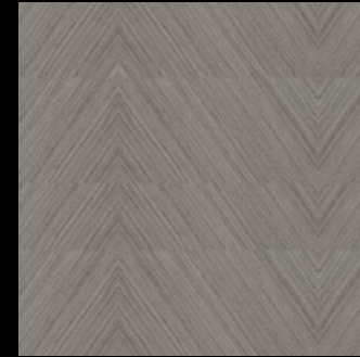
GREY ASH WOOD PANEL