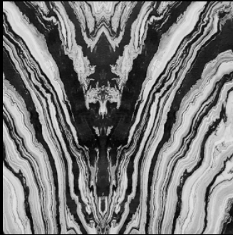
PHANTOM WHITE MARBLE

Interior sample board - Lobby walls, Floor & Ceiling