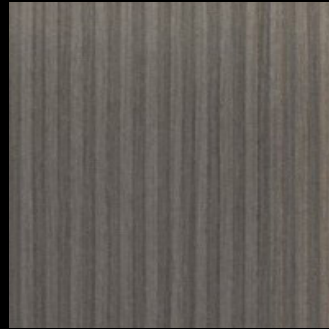
FLUTED GREY ASH WOOD PANEL