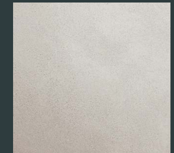
Light Grey Honed Concrete Paint