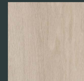
Tan Oak Wood